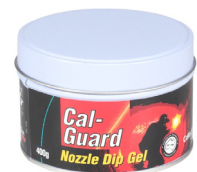
NOZZLE DIP GEL