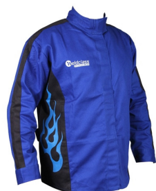
PROMAX BLUE FLAME

If you need the protection of a full leather welding jacket, you can't go past the "Promax BL7"! A special design which offers up to 40% reduced weight and superior comfort - without compromising durability and long wear-life. Opening is off-set to avoid the high wear area directly in front of the operator. Hook and loop closure avoids the added weight and discomfort of metal studs. Extended back offers better protection when bending, kneeling, etc. Selected premium cow hide leather, kevlar stitching and fully welted seams for longer garment life. Adjustable cuffs & collar.