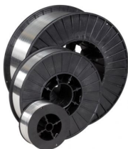
MIG WIRE ALUMINIUM