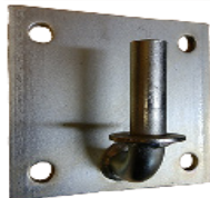
Large Gudgeon Plate